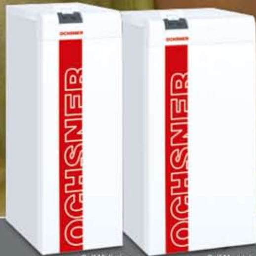
Golf Midi plus