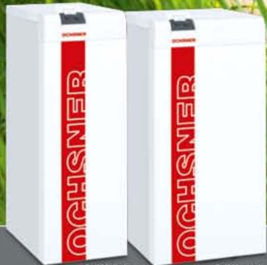
Golf Midi plus

The heating ratings relate to heat pump measurement data under standard conditions (heating performance/COP), taking into consideration the specified tolerances. Further references, see page 11.