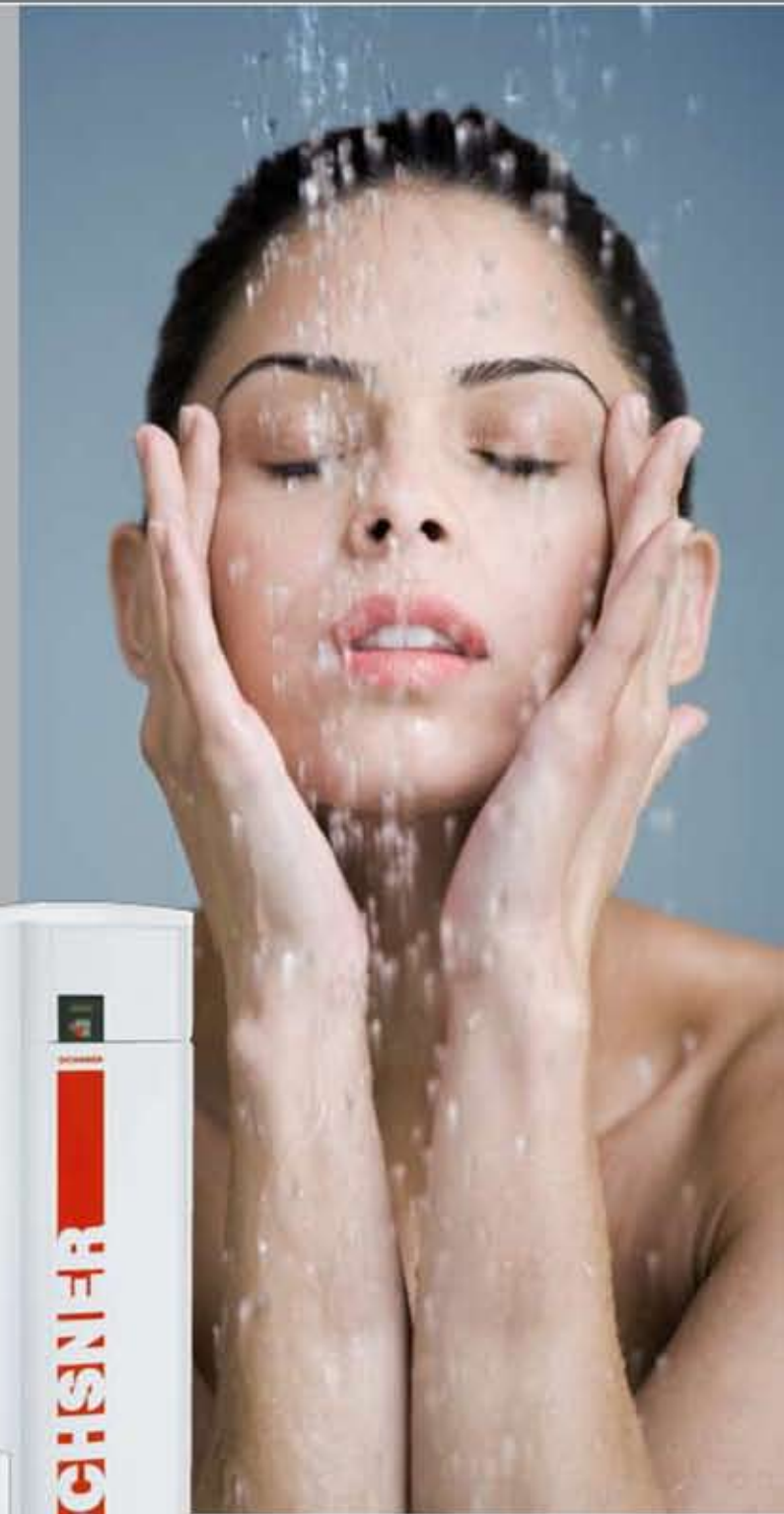
Europa Mini EWP

The hot water heating can, if desired, also be carried out with the heating heat pump. In this case, the hot water is supplied from an external storage tank. The heating regulator ensures that the hot water supply has priority at all times.